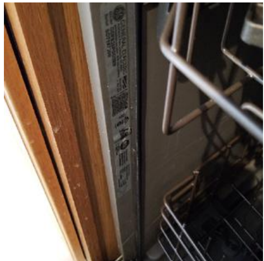
Taken on: 2019-02-14 10:50:30 Image