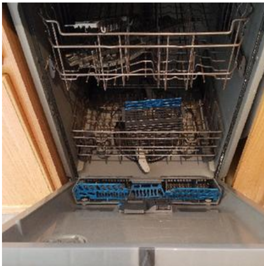
Taken on: 2019-02-14 10:50:26 Image