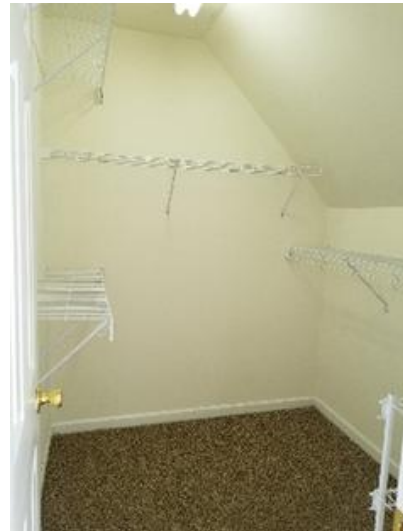
Taken on: 2019-02-14 10:41:13 Image