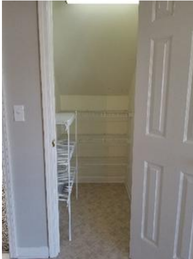
Taken on: 2019-02-14 10:49:35 Image