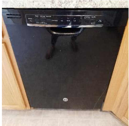
Taken on: 2019-02-14 10:50:20 Image