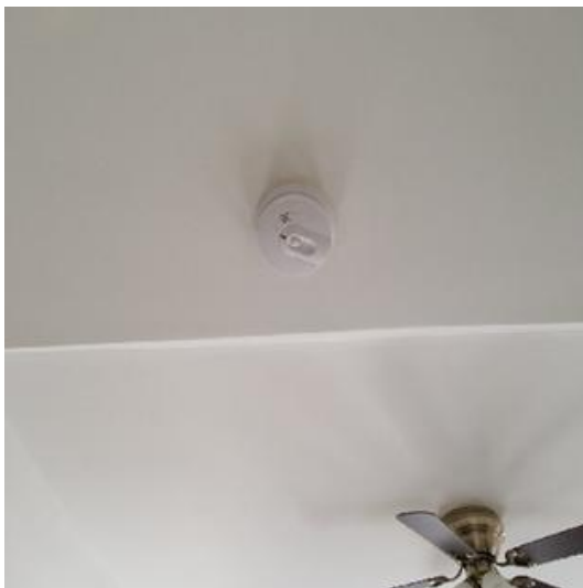
Taken on: 2019-02-14 11:11:29 Image