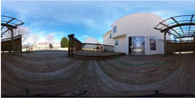
Taken on: 2019-02-14 10:54:14 360 Viewer