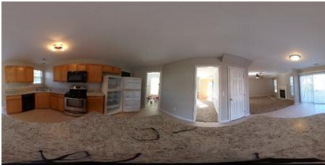
Taken on: 2019-02-14 10:46:23 360 Viewer