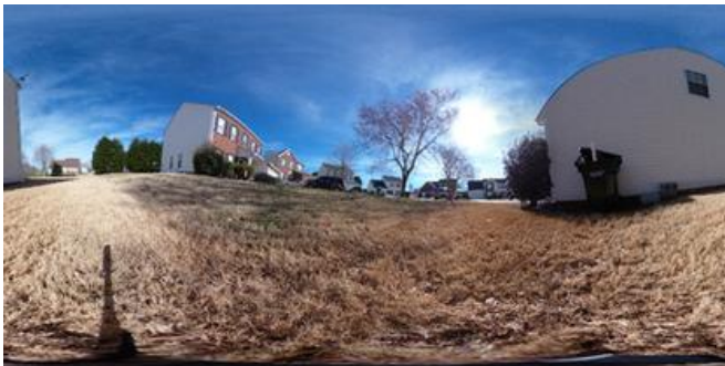
Taken on: 2019-02-14 10:57:29 360 Viewer