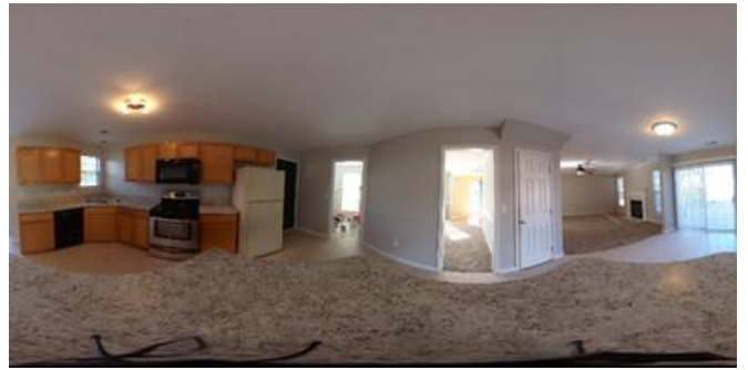
Taken on: 2019-02-14 10:46:39 360 Viewer