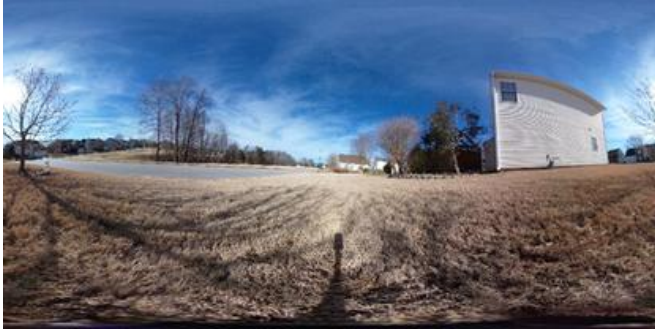
Taken on: 2019-02-14 10:55:20 360 Viewer