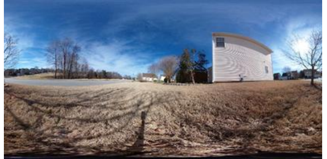
Taken on: 2019-02-14 10:56:02 360 Viewer