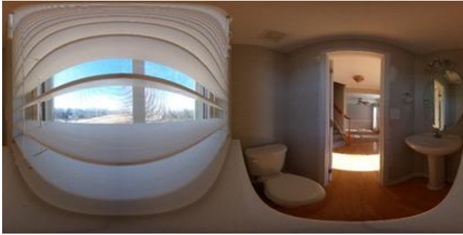
Taken on: 2019-02-14 10:45:52 360 Viewer