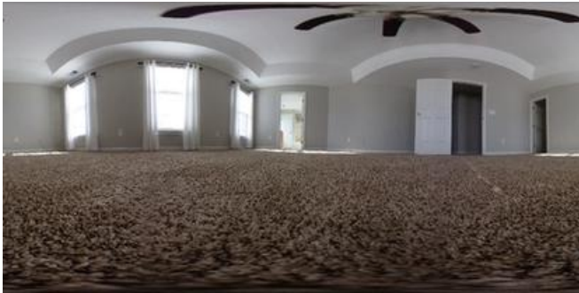
Taken on: 2019-02-14 10:36:26 360 Viewer